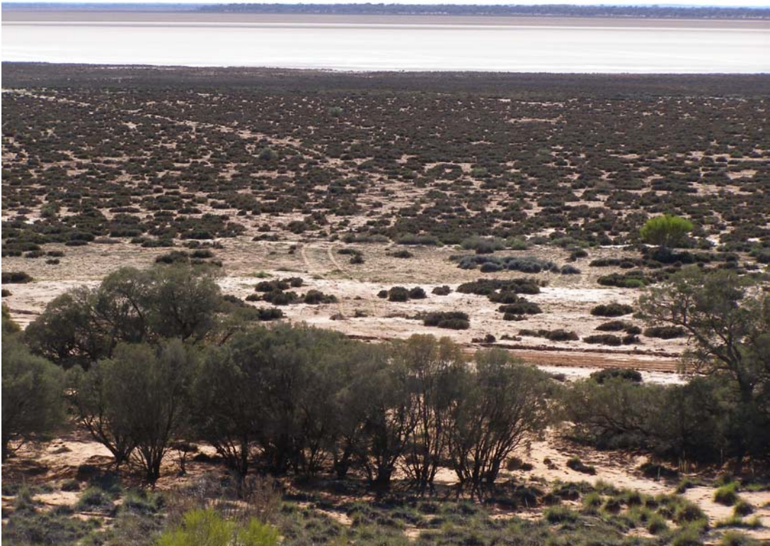
Figure 1 – Area of Centipede deposit where test pit will be undertaken

The Resource Evaluation Test Pit is an important part of the BFS process to improve geological, technical and environmental knowledge of the deposits.